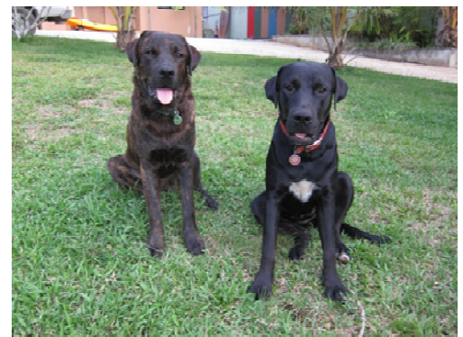
Scrapy & Millie