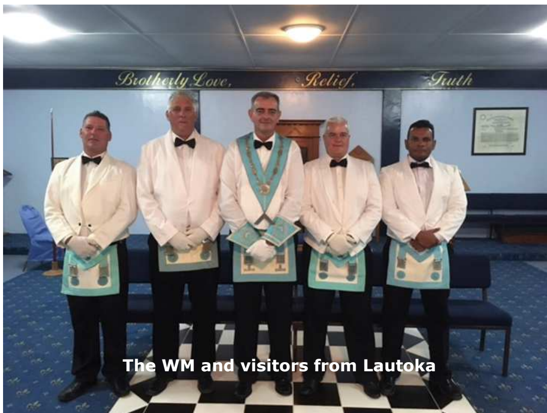
The WM and visitors from Lautoka