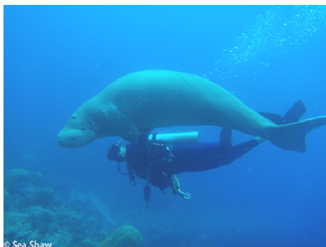
Diving with a dugong

As we all know Vanuatu can be a very challenging place but Masonry for me is a “constant” in a very rapidly changing environment with a great group of individuals.